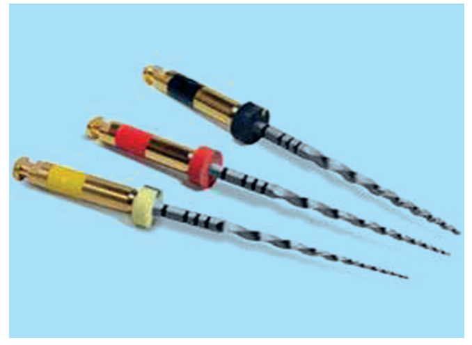
Fig. 1: WaveOne instruments: Small 21/06 (yellow ring); primary 25/08 (red ring); large 40/08 (black ring)