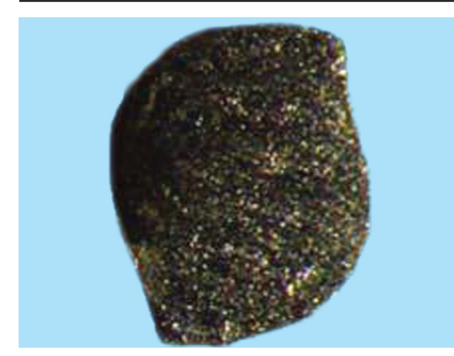
Fig. 6: Reciproc S-shaped crosssection

As the number of files used increased, the efficiency decreased. Only a few or no microcracks were detected after reusing files for five canals. The authors concluded that reciprocating files might be able to be reused up to five times with no critical changes in the metallurgical properties of the instruments.