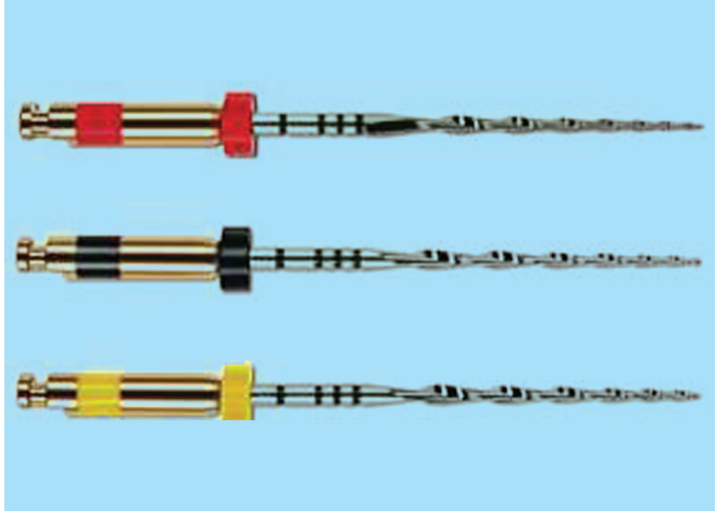
Fig. 5: Reciproc instruments: R25 (red ring); R40 (black ring); R50 (yellow ring)