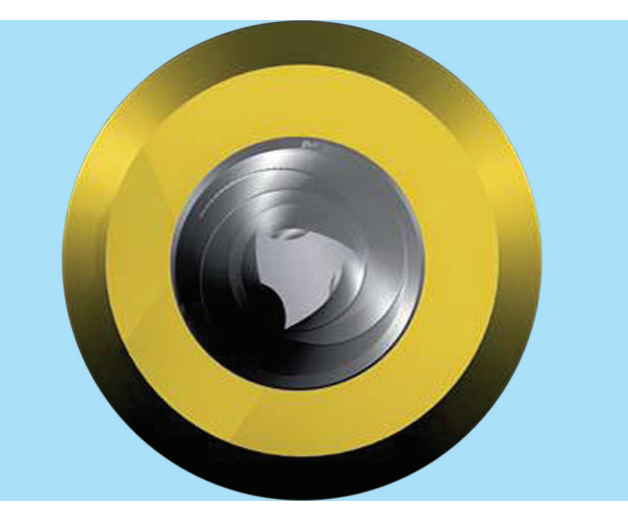
Fig. 2: WaveOne apical cross-section, modified convex triangular